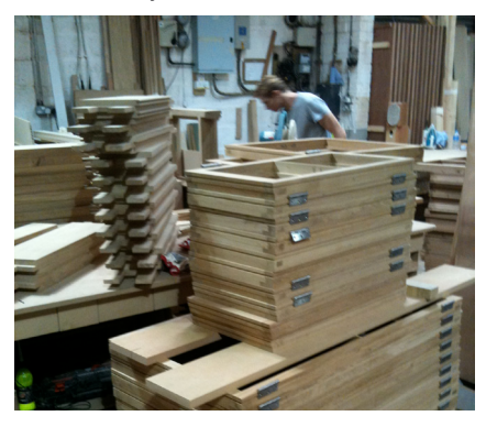
Below: new development brings direct and indirect benefits to the local economy

Looking ahead beyond the construction phase, the ability to source replacement parts or products locally and get equipment serviced at short notice is also advantageous and assists with speedy repair and maintenance. And like us, local supply chains have a vested interest in the future of Enfield and a desire to see the community and its economy prosper.